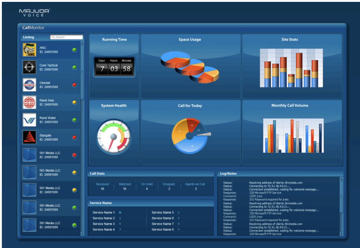
Figure 1.1 – MajudaAlert Dashboard

For more information about Majuda Voice, contact us at 888-9MAJUDA or (International) +1-561-981-0119 and visit www.majuda.com