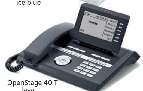
OpenStage 40 T lava