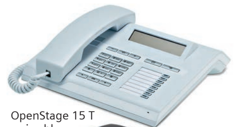
OpenStage 15 T ice blue