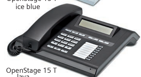
OpenStage 15 T lava