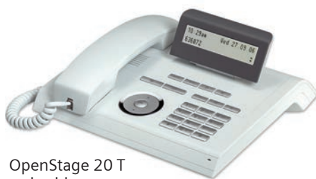
OpenStage 20 T ice blue