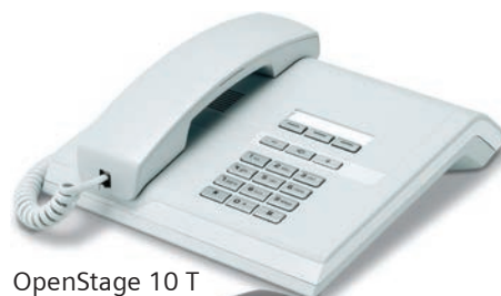
OpenStage 10 T ice blue

OpenStage 10 T, 15 T and 30 T are downwards compatible and can be operated like optiPoint phones.