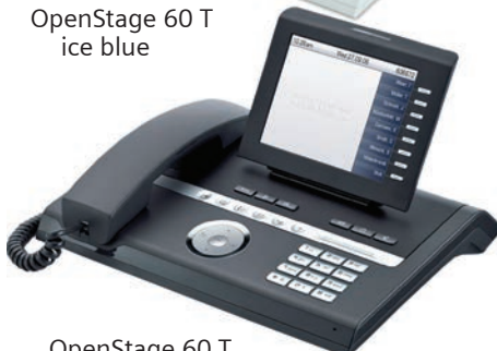
OpenStage 60 T lava