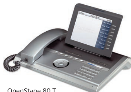
OpenStage 80 T