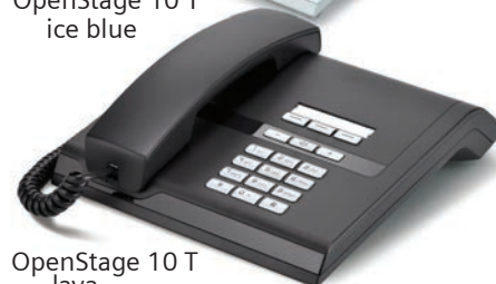
OpenStage 10 T lava