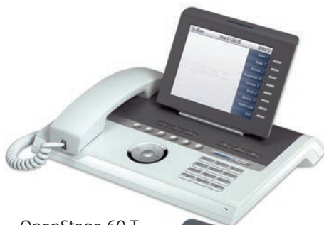
OpenStage 60 T ice blue