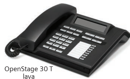
OpenStage 30 T lava