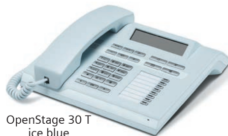
OpenStage 30 T ice blue