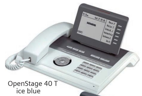
OpenStage 40 T ice blue