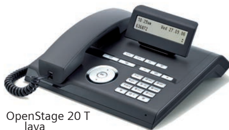
OpenStage 20 T lava